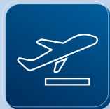
Permanent Departure from HK