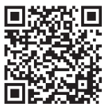
(OECD 經濟合作與發展組織)

作為財務機構，信安信託(亞洲)有限公司不獲允許提供稅務或法律意見。若您對您的稅務居民身份存有任何疑問，請詢問專業稅務顧問或瀏覽 OECD ( http://www.oecd.org/tax/automatic-exchange/crs-implementation-and-assistance/ ) 及稅務局 ( http://www.ird.gov.hk/eng/tax/dta_aeoi.htm ) 有關自動交換財務帳戶資料的網頁，或掃描此二維碼，以獲取更多共同匯報標準及相關資料。